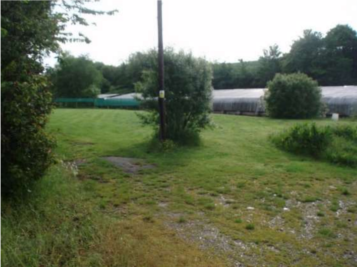
Looking down the site from the bank on the lane