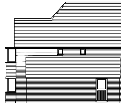
west elevation (side)