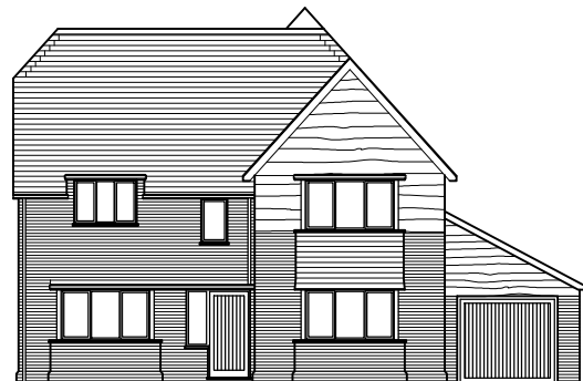
north elevation (front)