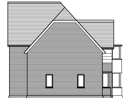
east elevation (side)

total floor area = 155.0m 2 excluding garage