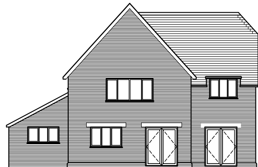
south elevation (rear)