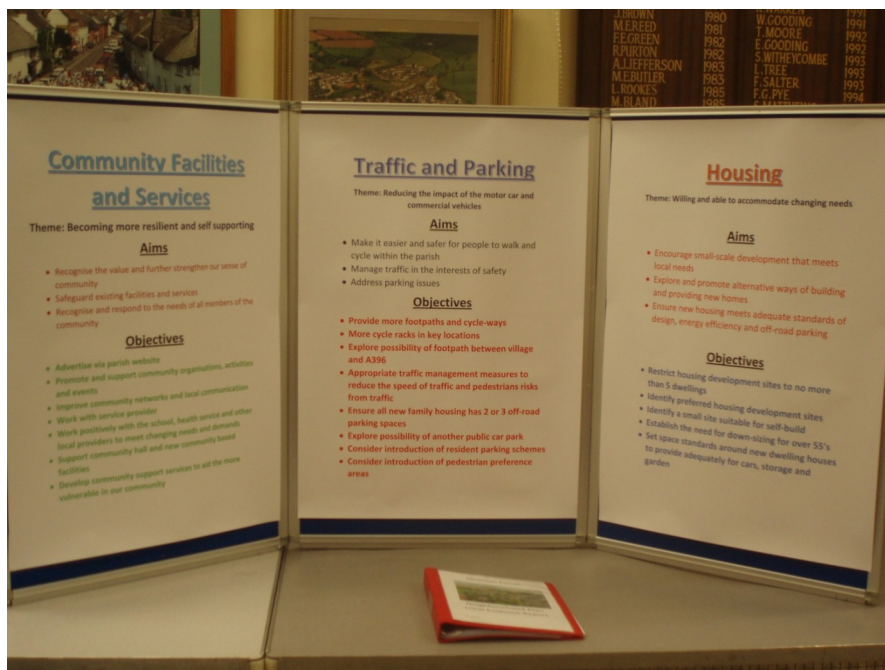
Silverton Neighbourhood Development Plan Proposal - Consultation Statement, provided to Mid Devon District Council from Silverton Parish Council