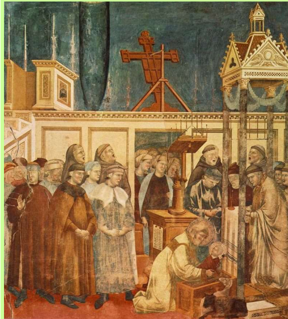
Institution of the Crib at Greccio, by Giotto di Bondone (1266–1337)

This year, we welcome children to add life and colour to our nativity celebrations. Since the medieval period, the liturgy of Christmastide has been leavened by theatrical enactments of Christ's birth. On Christmas Eve in 1223, in the Italian town of Greccio, Saint Francis of Assisi was reputed to have performed Midnight Mass in front of a life-sized nativity or crib scene, complete with live animals.